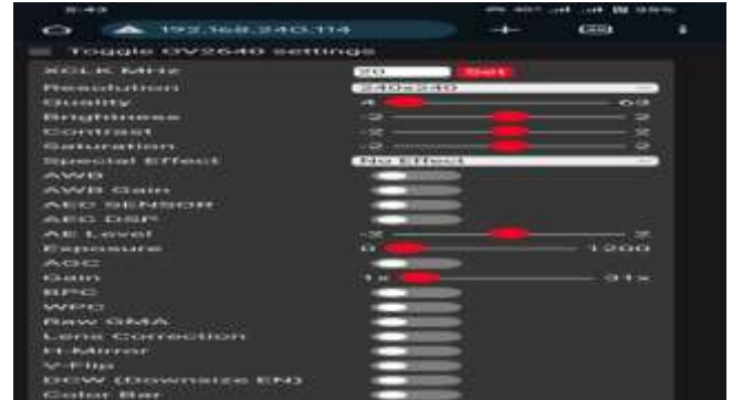
Fig 6.2: OV2640 Camera Settings Interface (ESP32-CAM Web UI)

The ESP32 CAM provided smooth and stable live video feed to the control device via Wi-Fi, enabling real-time visual monitoring.